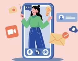
Mobile Apps & Communication Tools