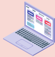
Online Assignment & Course Materials