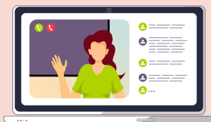
Videos with Captions & Transcripts