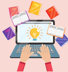
Learning Management Systems (LMS)