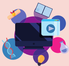
School Websites & Portals