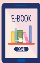
Digital Textbooks & PDFs